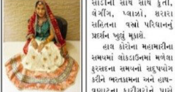
આણંદ, તા. ૨૧

ચતેત્ર પંચમાં હાલ જાજ સરની મોરમ જામી હતી છે. જે ખાસ ચુંદેરી શ્રેણી સાથે વિધાનગર ખાતે દીરાવા મહિલા મંડળમાં આગામી ૨૩, ૨૪ ફેબ્રુઆરીએ ડિપાર્ટમેન્ટ ડીઝાઇન એક્ટિવિઝમ યોજનાર છે.