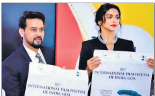
Union minister Anurag Thakur with actor Deepika Padukone in Cannes, Paris, on Wednesday.

"We'll do whatever we can to make India the content hub of the world and to make India destination of the world for filmmaking, film production and