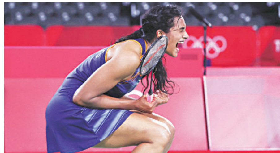
P V Sindhu reacts after her quarter-final win against Japan's Akane Yamaguchi on Friday.