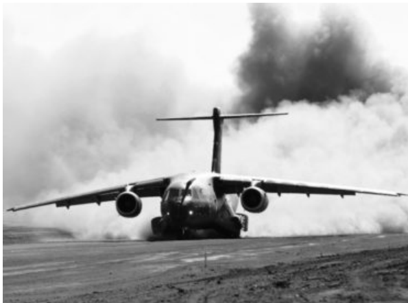
A file photograph of the C-390 Millennium medium transport aircraft operating off an unpaved runway

Embraer's C-390 Millennium MTA was first pressed into operational service in the Força Aérea Brasileira (FAB, or Brazilian Air Force) in 2019. The FAB flies 19 Millennium aircraft in its fleet. Besides these, the Portuguese Air Force flies five C-390 Millennium aircraft, Hungary