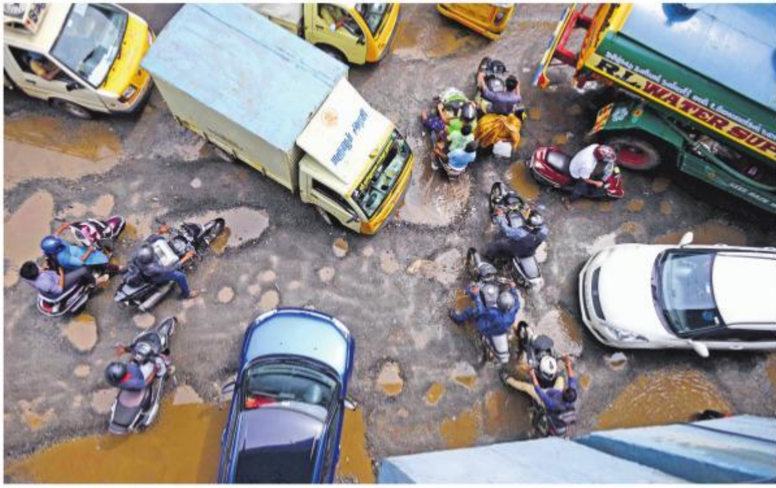
TARRED ROADS TOO MUCH TO ASK FOR? Commuters struggle to drive through a pothole-filled road at Ambattur in Chennai on Wednesday. A 32-year-old biker on Monday had hit a pothole on Anna Salai and died after being thrown under an MTC bus in the impact