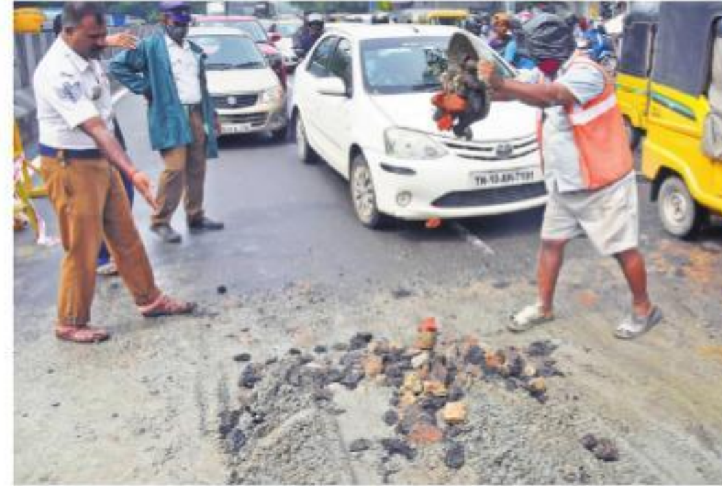
A pothole on the Poonamallee High Road at Kilpauk being filled with gravel and cement, in Chennai on Wednesday

In a survey by the corporation, 942 roads in the city were found to be in need of maintenance work, which includes filling up potholes. For filling, wet mix macadam, cement-concrete mix or cold mix are used, according to a release from the corporation on Wednesday. The civic body maintains 471 bus route roads and 34,640 interior