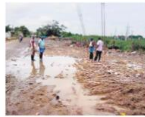
Senneerkuppam landfill was cleared after complaints were raised | EXPRESS

The area was among the first to be restored under the Cooum river eco restoration project under the Chennai Rivers Restoration Trust (CRRT) in 2016 when the accumulated solid waste was removed and the boundaries were fenced. However, with daily waste from the panchayat, including medical and poultry waste, being dumped on the road abutting the river, not only did the solid waste spill over to pollute the river but also proved to be a menace to local residents and commuters due to the stench. Landfills also produce leachate which can contaminate surface and groundwater.