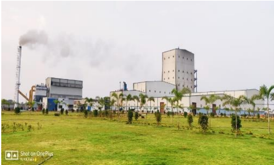
VINTAGE COFFEE PRIVATE LIMITED FACTORY