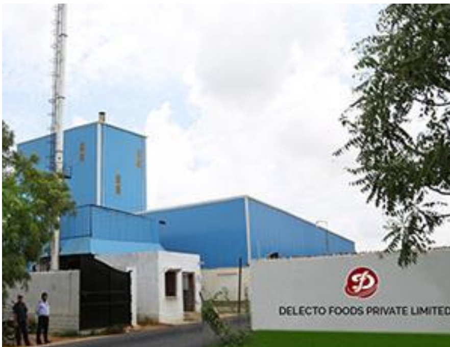
DELECTO FOODS PRIVATE LIMITED FACTORY