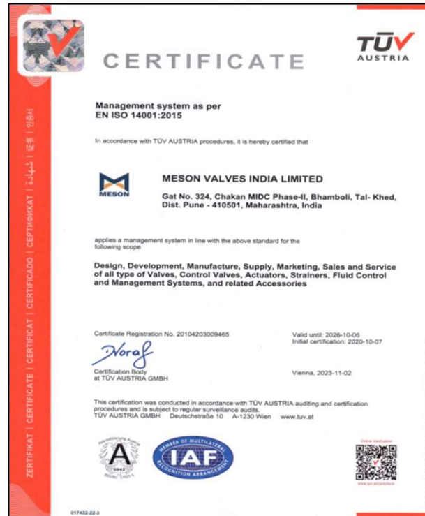
ISO 14001:2015 Environment Management System