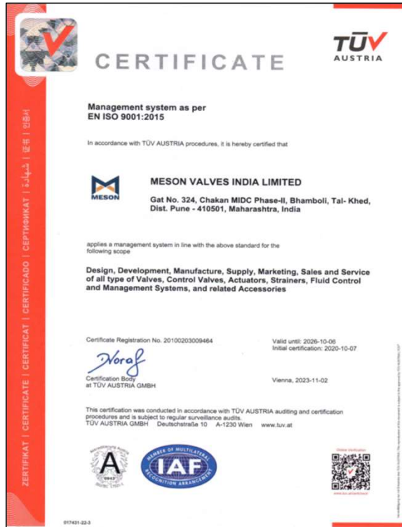
ISO 9001:2015 Quality Management System