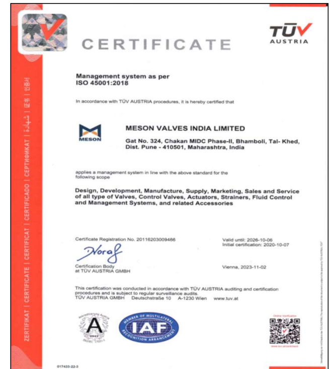
ISO 45001:2018 Health & Safety Management System