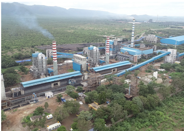
Aerial view of Coke Oven Plant