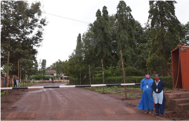
Lady Security Guards