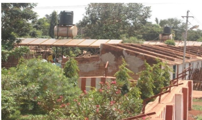
Solar water heater system at Deogiri Housing Colony

With a focus to completely eliminate utilisation of thermal coal for power generation for ferro alloys production, the Company has set-up Waste Heat Recovery Boilers and is in the process of commissioning and producing power using waste heat from Coke Oven plant. The Waste Heat Recovery Boiler, which is a co-generation plant as classified by the Government of Karnataka, has potential to generate about 212 mu per annum. Between 20 February 2020 until 26 March 2020, about 9.2 million units (mu) of energy was generated from the flue gases through the WHRB. Further details can be viewed at https://www.sandurgroup.com/SDF.html .