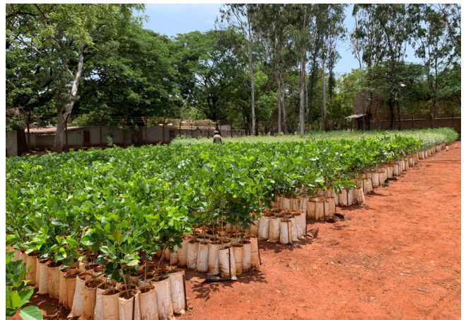
Nursery at MFA Plant