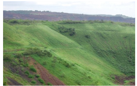
Coir Mat on Waste Dump

and respect to the various statutes and rules, has held the Company in good stead. The Government of India had appointed a committee, popularly known as Vasudeva Committee to study Manganese Ore Mining Procedures in India. The Report of the Committee, published in 1965, significantly noted: “Although in the case of a large number of mines, the mining operations do not follow any concerted or well thought out plan of development, there are a few bright exceptions such as mines controlled by Manganese Ore India Limited, M/s. Sandur Manganese and Iron Ores Limited and a few other companies who have planned the lay-out of their mines in a systematic manner.”