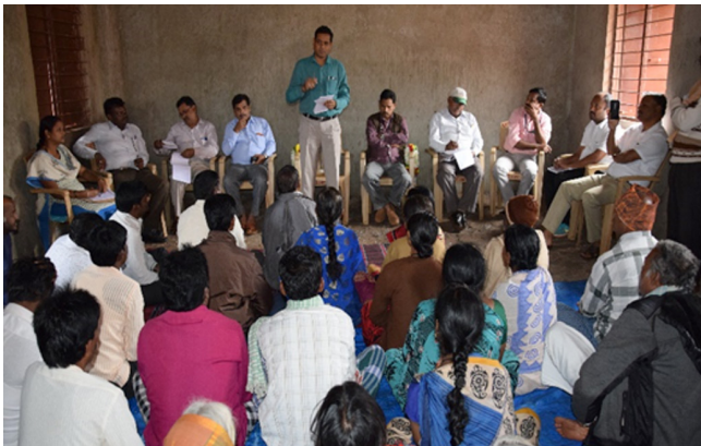
Consultation with Kammathuru villagers at Community Hall after adoption of Kammathuru village

Dedicated community liaison teams maintain regular and open dialogue with stakeholders, particularly local communities and undertake various community-related initiatives including preferential employment of local people, training and skill-development of locals, promoting and assisting local small businesses and self-help activities.