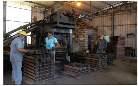
Fly-ash brick unit

The Company's water management plan includes rainwater harvesting, a water target to improve the efficiency and recycling of used water from the kitchens, bathrooms and laundry, and a water risk review to assess risks and opportunities associated with biodiversity. Recycled water (including from Sewage Treatment Plant) is used for dust suppression caused by vehicular traffic.