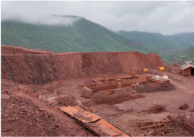
Construction of Downhill Conveyor System under progress