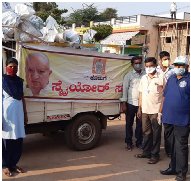
Vegetable distribution during COVID-19 at Krishna Nagar, Sandur

Though mining and integrated steel plant related operations come under essential services and goods, and are allowed to continue its operations, around end March 2020, the Company was forced to stop its mining operations, ferroalloy plant, power plant, and reduced its Coke Oven operation to bare minimum 30% capacity in the larger interest of safety of its employees and to ensure prevention of spread of COVID-19. Decision to stop Plant