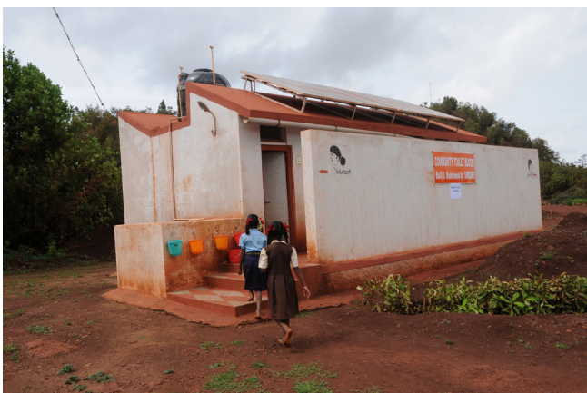
Community Toilet Block at Kammathuru Village