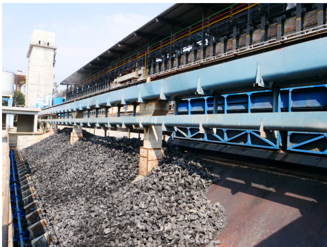
1 st Coke Out

Batteries 1 & 2 of the Coke Oven Plant have commenced trial operations in January 2020. Commissioning of Batteries 3 & 4 has been delayed in the backdrop of the COVID-19 pandemic and are now expected to commence trial operations in December 2020.