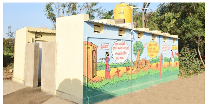
Community Toilet Block at Ayyanahalli with Awareness Painting

During the last 3 years (FY 2018, 19 & 20), SMIORE has spent ₹23.4 crore on 90 activities under CER, including construction of 2084 individual toilets. This is in addition to construction of 1000 toilets under the CSR program of SMIORE, thereby achieving a total of over 3000 individual toilets.