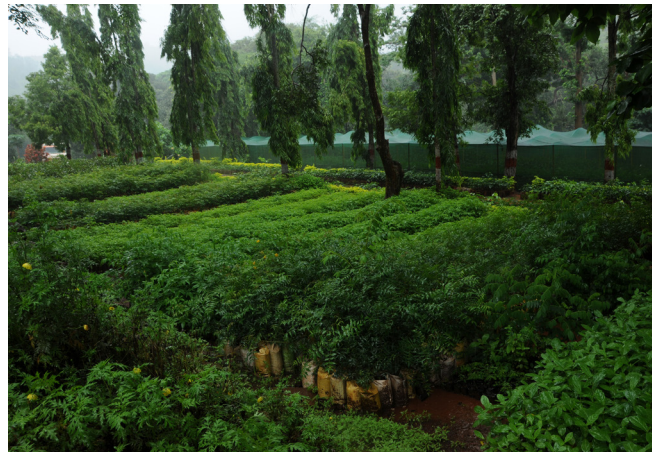
Nursery at Mines

Yes. The Company recognizes the need to address the global environmental issues such as climate change, global warming, etc., and endeavours to contribute its utmost to reduce climate change and global warming. Against the statutory requirement to plant 1.11 lakh trees as stipulated under the SEMP, the Company has planted more than 35 lakh saplings with about 70% survival within its mining leases. Also, as against a requirement of 34 Ha of green belt creation as stipulated in the Environmental Clearance for 1 mtpa steel plant, the Company has decided to create 11 ha of additional green belt. These initiatives can be viewed at https://www.sandurgroup.com/SDF.html .