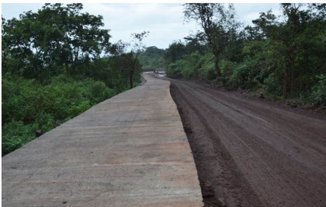
New CC road from SK Temple to Deogiri work under progress

Based on one such stakeholders consultation, the Company has, in the interest of public, undertaken construction of 35 kilometres of external roads at a cost of ₹ 85 crore to mitigate the impact of dust due to transportation of ores through trucks. The cost of construction of these external roads is being shared by other mining lessees and customers in the region.