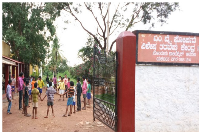
MYGSTC at Yeshwanthnagar