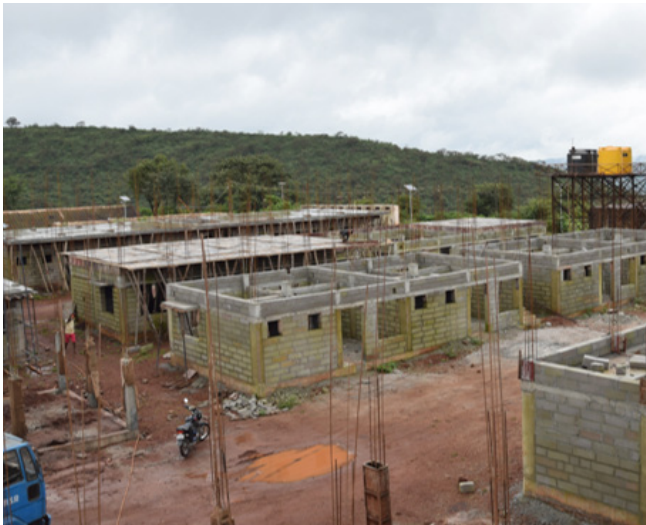
Construction of New Housing Colony at S. B. Halli under progress

The Company is building 192 quarters for its workers at Deogiri and Subbarayana Halli replacing the existing quarters which are more than 6 decades old. In view of the present situation, the Company is experiencing shortage of labour and accordingly, construction of these quarters is expected to be completed by 31 March 2021.