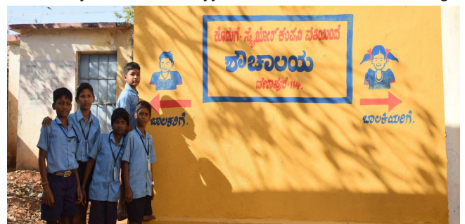
Danapura – Toilet Block at Government School