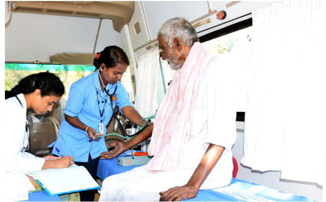
Rural Health Camps by Arogya