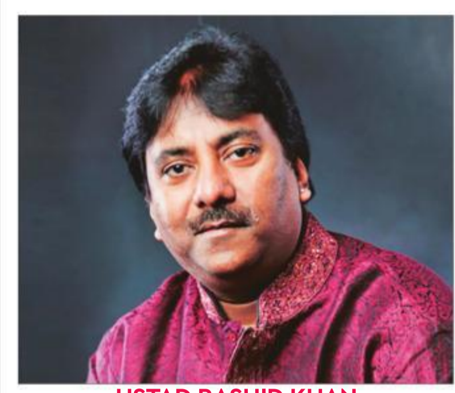
USTAD RASHID KHAN 1968-2024

EVERY TIME USTAD Rashid Khan sat down to perform anywhere in the world, those present had one demand — Yaad piya ki aaye, ye dukh saha na jaaye, haaye ram (The memories of my beloved haunt me, Alas, I cannot bear this grief) — the famed thumri by Kasur-Patiala gharana Doyen Ustad Bade Ghulam Ali Khan that remains the leitmotif to his mention.