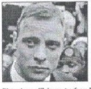
Pistorius will have to face his victims' parents as part of the parole-consideration process a prospect they sounded distressed by on Monday. The parents are 'shocked and surprised' at having to consider the abhorrent prospect, they expected, a lawyer for the family said.

Johannesburg, Agency. Oscar Pistorius, the double-amputee Olympic sprinter who garnered global headlines after killing his girlfriend in 2013, may soon be paroled from prison, South African corrections officials said Monday. Pistorius shot his girlfriend, Reeva Steenkamp, through a locked bathroom door in February 2013. He claimed that her death was an accident, and that he had fired his gun in the belief that an intruder had entered his upscale home in a Pretoria suburb. He was convicted of manslaughter later upgraded to murder and sentenced to 15 years. And on Monday, the Department of Correctional Services said Pistorius, 34, had served half his sentence, making him potentially eligible for parole under South African law. But the firm's victims' parents said at the parole-consideration process a prospect they sounded distressed by on Monday. The parents are "shocked and surprised" at having to consider the abhorrent prospect, they expected, a lawyer for the family said. At one point, Pistorius was not deemed eligible for parole until March 2023, but his lawyer asked South Africa's Supreme Court of Appeal to take account of the fact that Pistorius had already served in prison after his initial conviction for manslaughter in 2014, but after prosecutors challenged the verdict, the Supreme Court of Appeal replaced it with a finding of murder.