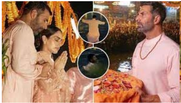
In one of her pictures, Manushi is seen praying, folding her hands, with her eyes closed. Before jumping into the

Mumbai, May 31 (IANS) As his film 'Samrat Prithviraj' is all set to release on the big screen, Bollywood's 'Khiladi' Akshay Kumar and his co-star Manushi Chhillar performed a puja on the banks of river Ganga in Varanasi. He was then seen taking a dip in the Ganga. Akshay took to Instagram, where he posted a video of himself wearing a pink kurta and holding a prayer plate in his hands with diyas and flowers in it. Manushi is seen standing next to him dressed in a pink salwar-kurta.