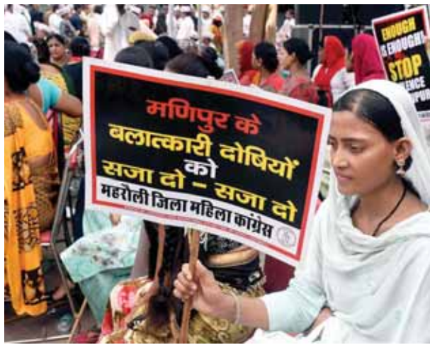
A protest in New Delhi over the violence in Manipur.

The Opposition parties have planned joint protests in Parliament on Monday on the situation in Manipur. They have been demanding a statement