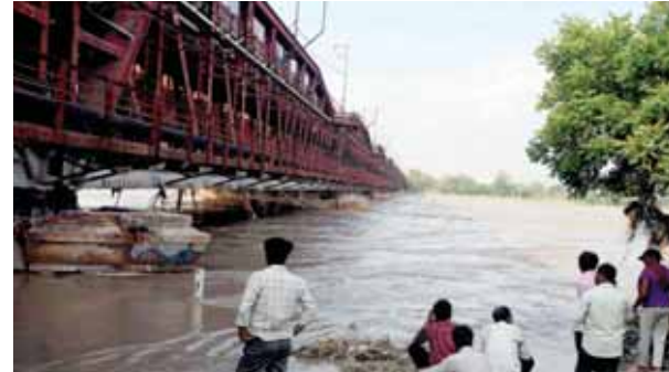
Rising Yamuna water flows under the Old Railway Bridge.