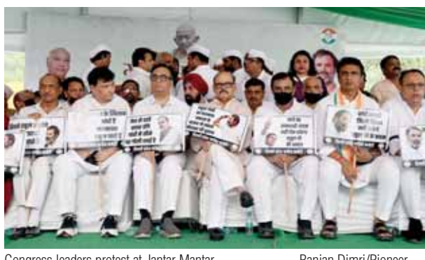
Congress leaders protest at Jantar Mantar.

The Congress said silent protest sought to draw attention to the issues affecting common people and emphasized the party's commitment to address concerns related to unemployment and inflation both inside and outside