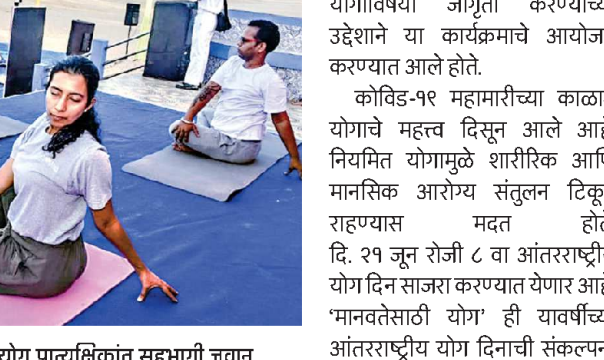
भारतीय तटरक्षक (गोवा क्षेत्र) दलाच्या योग प्रारंभिकता सहभागी जवान. शरीर आणि मन निरोगी ठेवण्यासाठी योगासने कुठेही केले जाऊ शकतात हे अधोरेखित करण्यासाठी तसेच स्थानिकांमध्ये

लोकमत न्यूज नेटवर्क वास्को : पंतप्रधान नरेंद्र मोदी यांनी केलेल्या आवाहानानुसार आंतरराष्ट्रीय योग दिनाचे महत्त्व सामान्य नागरिकांपर्यंत पोहोचवण्यासाठी भारतीय तटरक्षक दल, गोवा क्षेत्र यांनी मंगळवारी (दि. ३१) येथेसह समुद्रकिनार्यावर योग प्रारंभिकतांचे आयोजन केले होते. तटरक्षक दलाचे जवान आणि कुटुंबीय, स्थानिक मच्छीमार असे सुमारे २५० जणांनी यात सहभाग घेतला.