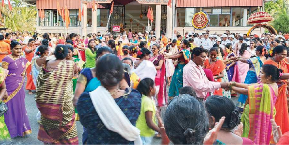
वास्कोतील नवसाच्या पालखी सोहळ्यात सहभागी भाविक.