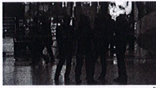
A man went on a "stabbing rampage" near South Korea's Seohyeon subway station in Bundang, the police said on Thursday, with as many as 10 people reported wounded two weeks after a similar attack killed one person. The suspect "had been arrested at the scene", the official said.