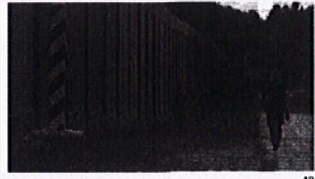
Polish and Lithuanian leaders held an urgent meeting on Thursday in a strategically sensitive area where the NATO nations border Belarus and the Russian territory of Kaliningrad, warning that they are braced for provocations from Moscow and Minsk. The NATO countries on the eastern flank have felt under pressure for years.