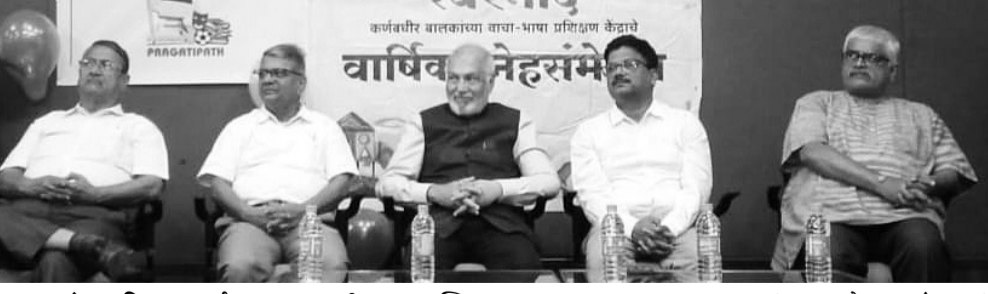
अनघा वाचासुंदर प्रतिष्ठान कार्यक्रमात व्यासपीठावर उपस्थित मान्यवर.