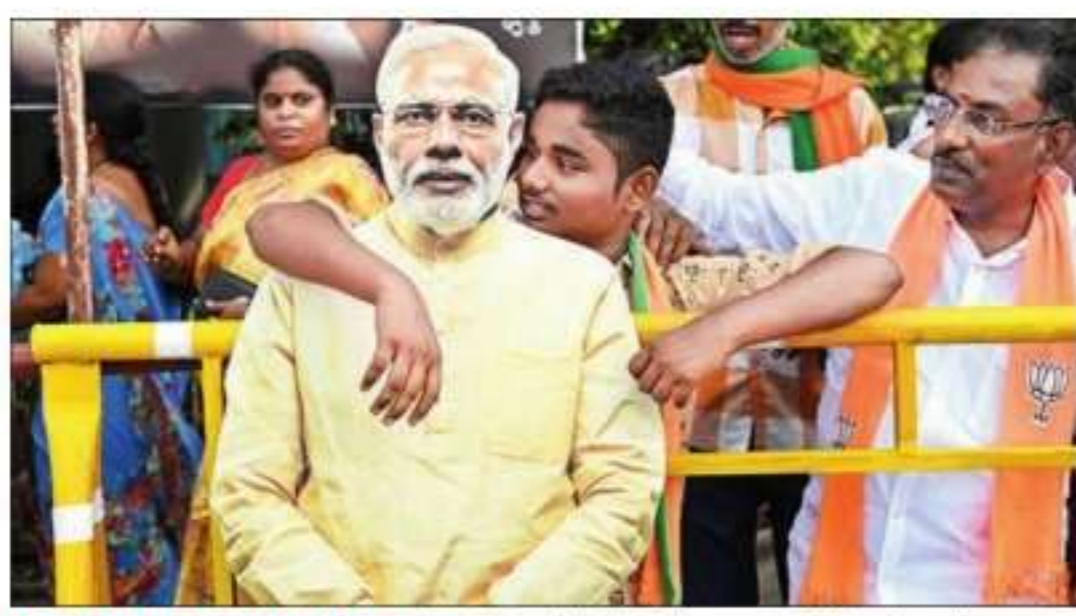
MERA PRADHAN MANTRI : BJP said that the opposition has been launching personal attacks on Modi for the last 16-17 years

The campaigns around the PM's perceived image of honesty and anti-corruption spearhead turned out to be a big success as the Congress's attempts to target him over alleged corruption in the Rafale fighter aircraft deal proved to be a non-starter with BJP un-