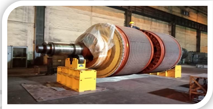
Manufacture of New Winding Coils & Complete Reinsulation of 2X5000 KW DC Motor Armature, Weighing 100 Tons (Heaviest DC Motor Armature in India)