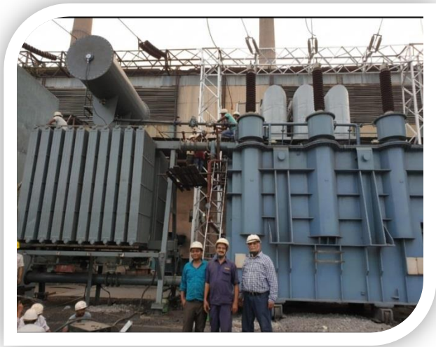
Supply & Erection of Bus Duct and Radiator Bank for a Fire Damaged 80 MVA, 132 KV/11 KV Power Transformer.