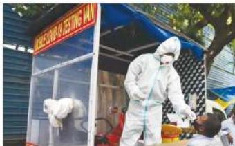
Delhi government to ensure that the official orders and directions issued by it and the court with regard to real time update of data of availability of beds and ventilators as also conducting tests be followed by the hospitals. It also directed that the ambulance services, for Covid and non-Covid patients, and the helpline should continue to operate and the nodal officers appointed by the Delhi government in its hospitals should keep in mind the difficulties of the people. With these observations and directions the court disposed of the PIL initiated by it, on the basis of a video clip of a man who had to run from pillar to post to get his mother hospitalised after she

MM BUREAU New Delhi/July 28 The Delhi High Court Monday said the AAP government has taken adequate steps like increasing the number of ambulances, augmenting the capacity of helpline, ramping up testing facilities and creating plasma banks to handle the Covid-19 cases in the national capital. A bench of Chief Justice D N Patel and Justice Prateek Jalan said that in view of the steps taken by the Delhi government it was not going to further monitor the PIL initiated by the high court to assess the preparedness of the authorities here to handle the rising Covid-19 cases now and during the coming days. The bench directed the