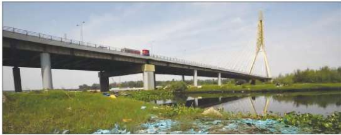
The floodplains, some of which has topped into the river bed underneath the Sarai Kale Khan bridge. There is so much debris that an active river channel is now disconnected from the main river. The debris was dumped recently

MM BUREAU New Delhi/July 28 The National Green Tribunal (NGT)-appointed Yamuna Monitoring Committee has asked the Delhi Pollution Control Committee (DPCC) to submit a report on the dumping of waste, including material used for manufacturing face masks, and construction debris at two sites on the Yamuna floodplains that could be "constricting" the flow of the river. The waste has been dumped underneath the Signature Bridge and the Sarai Kale Khan flyover. NGT asked for the report after an NGO, South Asian Network on Dams, Rivers and People (SANDRP), posted pictures and videos of the dump on the floodplains. "As per an NGT order of 2015, any kind of dumping