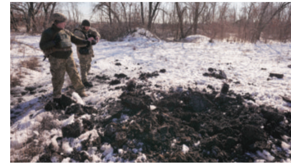
Ukrainian servicemen survey the impact area of a rocket that landed close to their positions on a front line outside Popasna, Luhansk region, eastern Ukraine on Monday

PRESS TRUST OF INDIA New Delhi, 15 February