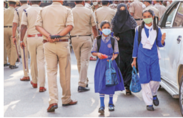
Students arrive to attend a school in Bengaluru that reopened after Karnataka HC interim order restrained students from wearing religious symbols inside the classroom

PRESS TRUST OF INDIA New Delhi, 15 February