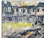
The houseboats after the fire in the Dal Lake on Saturday.