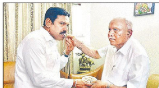
BS Yediyurappa with son Vijayendra on Friday

"The BJP is a shining example of anti-neopism in Karnataka. The party has shown its commitment to meritocracy by appointing B.S. Yediyurappa's son Vijayendra as the Karnataka BJP state president. The BJP is truly a party with a difference," Srinivas commented on X.