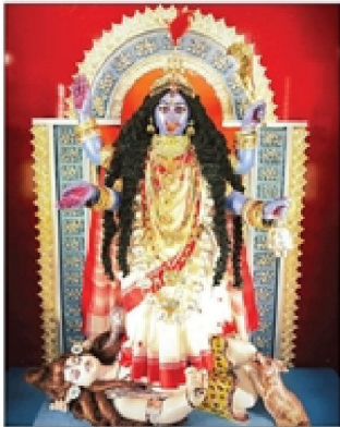
মুম্বাইর বাড়ির স্মারিতামা। শ্রমিকের হাতে বিচারে বাড়ির... মুম্বাইর বাড়ির স্মারিতামা। শ্রমিকের হাতে বিচারে বাড়ির...