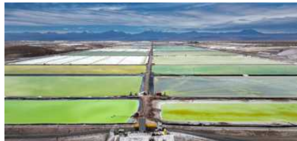
KEY MINERAL. Lithium is critical for India as the country looks to push EVs both in the public and private transportation space

NMDC Ltd has begun prospecting for lithium in Australia's Mt Bevan region through its partner, Hancock Prospecting Pty.