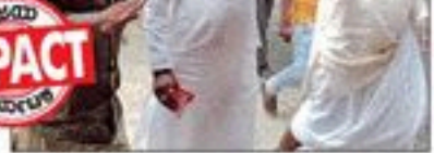
ಶಾಲೆಯ ಸ್ಥಿತಿಗತಿಗಳನ್ನು ಪರಿಶೀಲಿಸಿ, ಶಾಲೆಯ ಸುಧಾರಣೆಗಾಗಿ ಅಗತ್ಯ ಕ್ರಮಗಳನ್ನು ಕೈಗೊಳ್ಳುವಂತೆ ಸೂಚನೆ ನೀಡಿದರು.