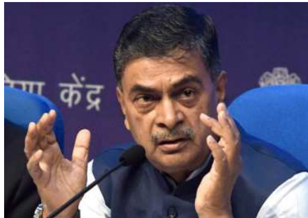
NEW PARADIGM. RK Singh, Power Minister, at a press conference on 'Transformative and future-ready developments in the infrastructure sector' in New Delhi, on Friday. KAMAL NARANG

carbon credits and sale outside India are also expected over the next few days.