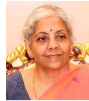
Nirmala Sitharaman, Finance Minister

Finance Minister Nirmala Sitharaman on Friday said regional rural banks (RRBs) in South India performed better than the national average in certain parameters.