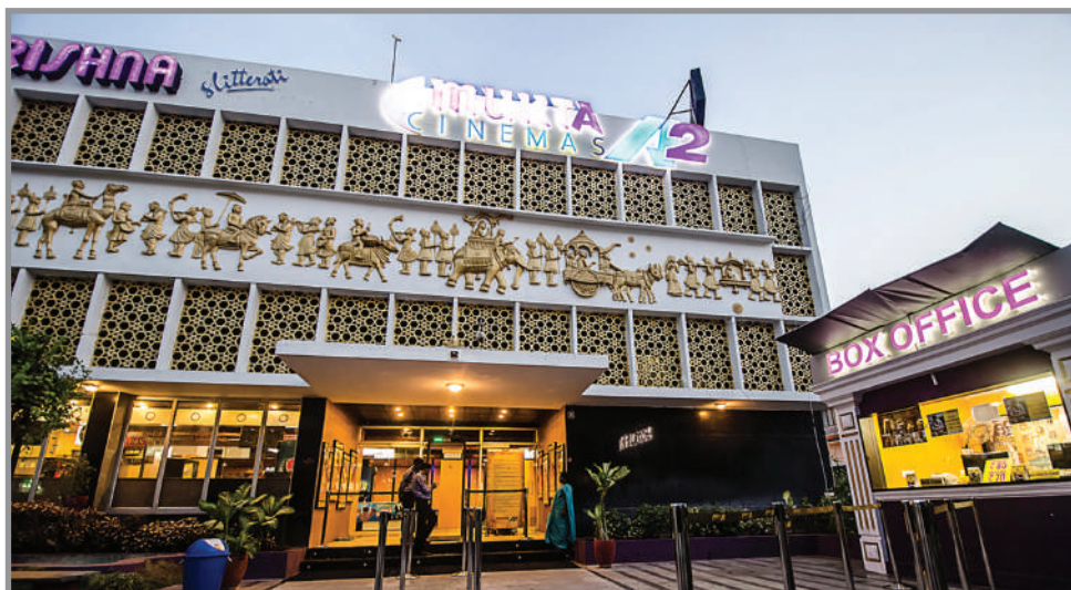
Mukta A2 Hyderabad Exterior