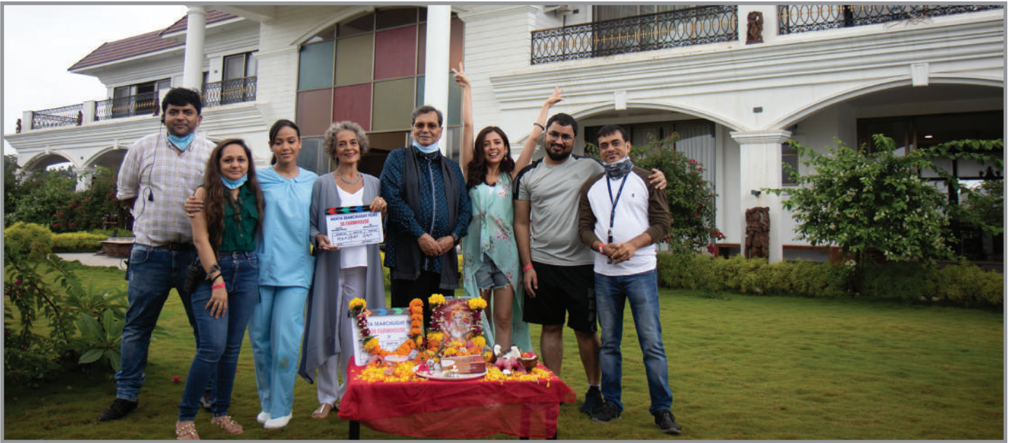
Mahurat shot of Mukta Arts' new Production '36 Farmhouse'