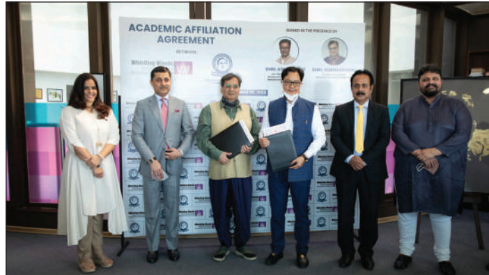
WWI-Rajiv Gandhi National Institute of Youth Development MoU Signing in the Presence of then Sports Minister Shri Kiren Rijiju

Another subsidiary of the Company, Connect.1 Limited is monetising all of Whistling Woods' content catalog on all digital platforms since 2012. Over the past year, Connect.1 has been the pioneer in expansion of short format content publishing on the many OTT platforms that have been established in India, including India's largest OTT platform – Disney+ Hotstar. Today, in addition to Hotstar and YouTube, WWI content is streamed on several OTT platforms like EpicOn, Hungama Play, Shorts TV, Sony Liv, to name a few, and will soon be seen globally on Amazon Video Direct as well, discussions for which are underway presently.