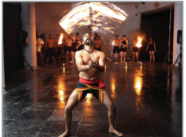
WWI Actors Studio Kalaripayattu Fire Performance