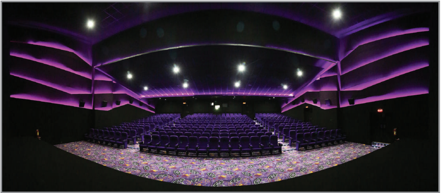
Mukta A2 Aurangabad Auditorium