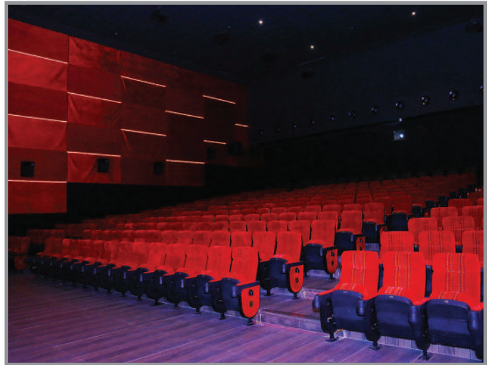
Mukta A2 Karimnagar Auditorium