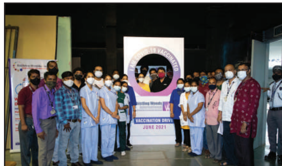
Mukta and WWI Corporate Vaccination Drive

As I said at the beginning of this statement, one of the things I am most grateful for during this year has been that the Mukta Group grew together in this adversity as a family. I am pleased to say that Mukta Arts, Mukta A2 Cinemas and Whistling Woods International ran a vaccination drive for its staff, students and faculty members and their families in a free of cost initiative. We managed to get over 300 people vaccinated and we hope that we will be able to do this again for our students as and when they begin to return to campus. Vaccination efforts are a huge part of how businesses can overcome this terrible pandemic and we are happy to be able to aid our employees and their families in trying to get their normal lives back.