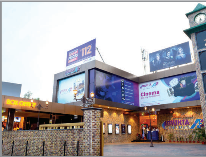
Mukta A2 Bhilai Exterior