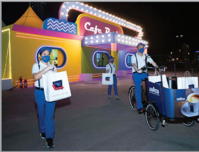
Mukta A2 Bahrain Drive-In F&B Service