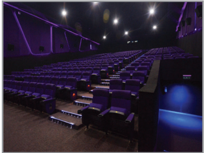
Mukta A2 Vizag Auditorium