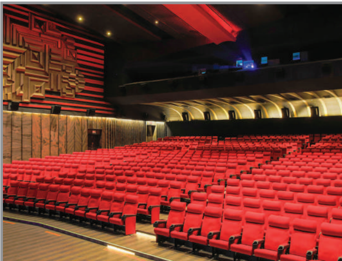
Mukta A2 New Excelsior Auditorium