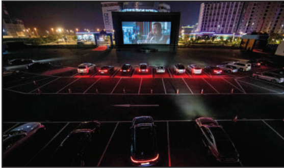
Mukta A2 Bahrain Drive-In

Mukta A2 Bahrain too had a tough year with the theatre closed for most of the fiscal. There was a brief period where we partnered Pico to roll out the country's first drive-in theatre and initially it was a good success but eventually, the response petered out as the pandemic ramped up there as well. Work on the Dana Mall property was also affected by the virus and now that 10 screen property renovation, where Mukta A2 is a management partner, will likely only finish by the end of 2021.