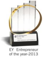
EY Entrepreneur of the year-2013