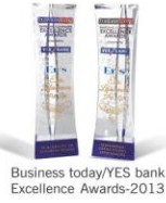
Business today/YES bank Excellence Awards-2013