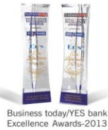
Business today/YES bank Excellence Awards-2013