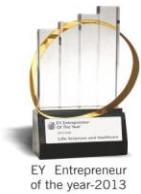
EY Entrepreneur of the year-2013