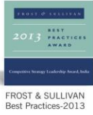
FROST & SULLIVAN Best Practices-2013