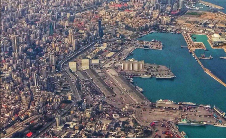
The port of Beirut before and after today's catastrophic explosion.