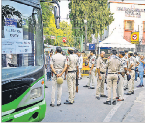
Police outside the polling station at Adarsh Bauka Vidyaaya in Gole Market.