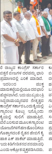
ರಾಜ್ಯದ ರಾಜಕೀಯ ಮತ್ತು ಸಾಮಾಜಿಕ ಜೀವನದ ಬಗ್ಗೆ ಹಲವಾರು ಬರಹಗಳನ್ನು ಪ್ರಕಟಿಸಿರುವ ಪಾರ್ಕ ಪ್ರಧಾನಿ, ಈ ಬಗ್ಗೆ ಸಂಸದರ ವರ್ತನೆಯನ್ನು ವಿರೋಧಿಸಿ ರೈತರ ಪ್ರತಿಭಟನೆ ತಪ್ಪೊಪ್ಪಿಕೊಂಡಿದ್ದಾರೆ.

ಸಂಸದರ ವರ್ತನೆಯನ್ನು ವಿರೋಧಿಸಿ ರೈತರ ಪ್ರತಿಭಟನೆ ತಪ್ಪೊಪ್ಪಿಕೊಂಡ ಪಾರ್ಕ ಪ್ರಧಾನಿ. ರಾಜ್ಯದ ರಾಜಕೀಯ ಮತ್ತು ಸಾಮಾಜಿಕ ಜೀವನದ ಬಗ್ಗೆ ಹಲವಾರು ಬರಹಗಳನ್ನು ಪ್ರಕಟಿಸಿರುವ ಪಾರ್ಕ ಪ್ರಧಾನಿ, ಈ ಬಗ್ಗೆ ಸಂಸದರ ವರ್ತನೆಯನ್ನು ವಿರೋಧಿಸಿ ರೈತರ ಪ್ರತಿಭಟನೆ ತಪ್ಪೊಪ್ಪಿಕೊಂಡಿದ್ದಾರೆ.