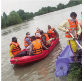
Officials raided the den in boats and seized raw material