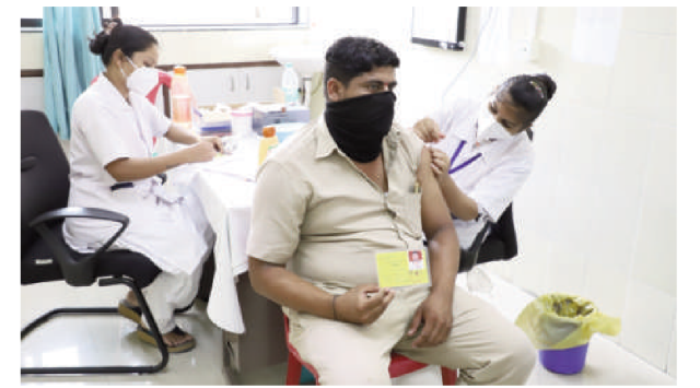
A man receives his first Covid jab

After almost a month, the Navi Mumbai Municipal Corporation (NMMC) administered Covid vaccines at its all centres the city on Friday. In fact, the civic body added 17 more centres to the existing 74 centres, taking the total number of centres to 91. Around 13,000 citizens were given the first dose of the vaccine on Friday.