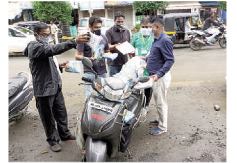
MBMC officials also caught a biker carrying a huge quantity of plastic bags

Muthe said, "Apart from standing instructions of keeping an eye on banned plastic vendors and users, sanitary teams have been directed to ensure proper cleanliness work by contractual workers, regular inspection of manholes and to maintain litter-free roads." In 2018, the MBMC had formed 13 special