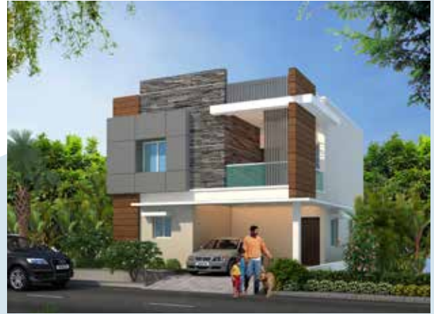
Manjeera Blue, Ongole