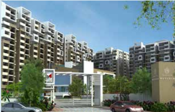
Manjeera Monarch, Vijayawada