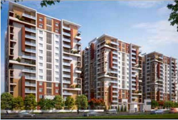
Vasavi Lake City, Hafeezpet