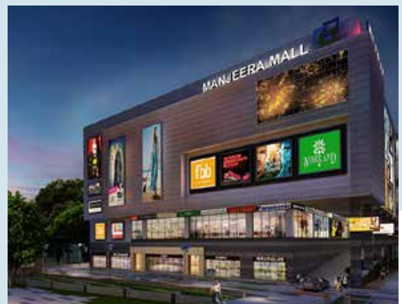
Manjeera Mall, Rajahmundry