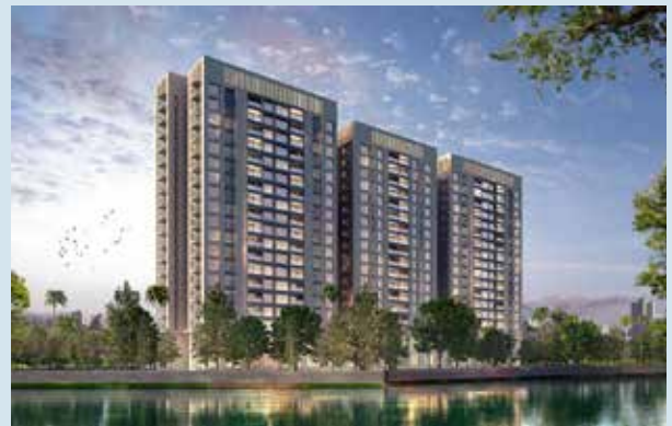
Newyork by Manjeera, Bangalore