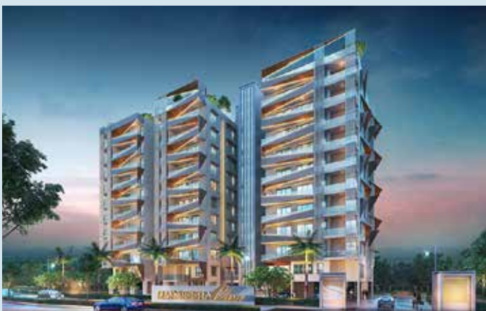
Manjeera Casa, Hyderabad