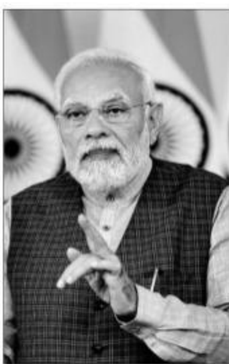
THE PRIME MINISTER under-

scored the importance of women-led development, and highlighted the achievements made by Indian women in various fields, including, aviation, and in the Chandrayaan mission.