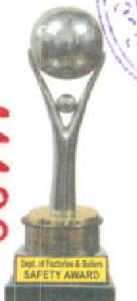
2009 - FIRST PRIZE