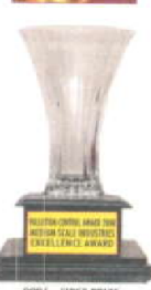
2005 - FIRST PRIZE 2007 - FIRST PRIZE