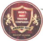
INDIA'S MOST TRUSTED COMPANY