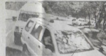
Traffic snarl at Burliar along Nilgiris-Coimbatore border.

Traffic snarls irk flower show visitors near Ooty