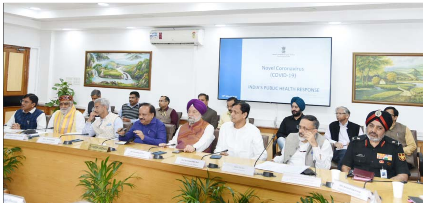
The Union Minister for Health & Family Welfare, Science & Technology and Earth Sciences, Dr. Harsh Vardhan chairing a high level meeting of the Group of Ministers (GoM) to discuss on Novel Coronavirus (COVID-19) - India's Public Health Response, in New Delhi.