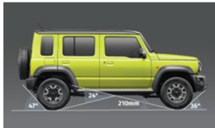
Ample Body Angles