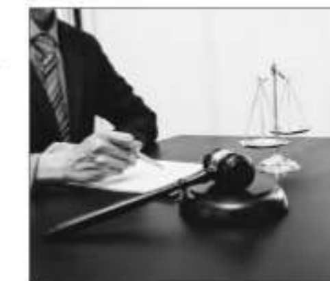
Whatever the nature of their duties, vocation and workplace, women must be provided all the facilities to which they are entitled, the HC said

"To become a mother is the most natural phenomenon in the life of a woman. Whatever is needed to facilitate the birth of a child to a woman who is in service, the employer has to be considerate and sympathetic towards her and must realise the physical difficulties which a working woman would face in performing her duties at the