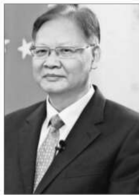
Xu Feihong, the newly appointed Chinese Ambassador to India

"The Chinese side always believes that China-India ties should not be defined by any single issue or area; the boundary question is not the entirety of the relationship. Speaking at the Indian Council of World Affairs in September 2014, President Xi Jinping said that we must not focus our attention only on differences and forget about our friendship and cooperation in various fields, and improve and advance the