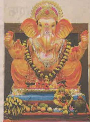
खोर्ली-म्हापसा येथील विश्वस्त मंडळाचे श्री गणराय.