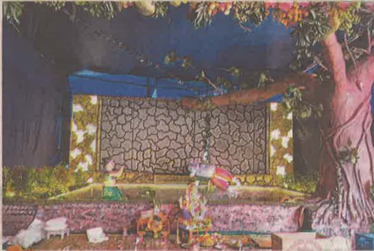
तिळामळ सार्वजनिक गणेशोत्सव मंडळाची मूर्ती.