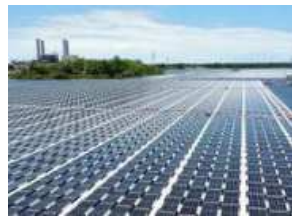
A file photo of a floating solar power plant at an NTPC unit

"NGEL's monetisation process gained momentum in May-June, and has generated good interest. Around 13 EoIs have been received including from CPPIB, Brookfield, TAOA, Petronas, and ArcelorMittal. They are starting with 5-10 per cent, but can go up to 26 per cent. NTPC expects NGEL to be valued at around