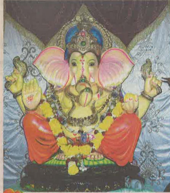
नानोडा सार्वजनिक गणेशोत्सव मंडळाचा श्री गणेश.