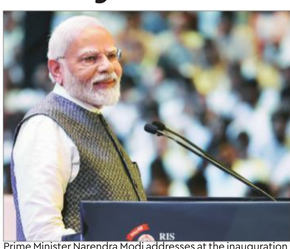
Prime Minister Narendra Modi addresses at the inauguration of the G20 University Connect Finale at Bharat Mandapam, in Pragati Maidan, New Delhi on Tuesday.

Asserting that India's diplomacy reached new heights in the past 30 days, the prime minister said the G20 Summit could have been limited to a diplo-