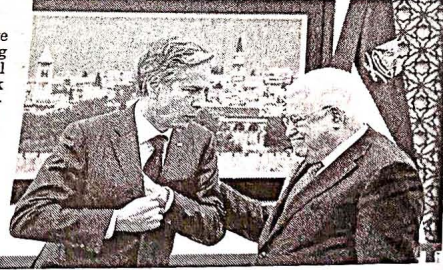
Palestinian President Mahmoud Abbas (R) welcomes US Secretary of State Antony Blinken in Ramallah on Tuesday

Blinken was meeting Palestinian leader Mahmoud Abbas in the West Bank town of Ramallah on Tuesday, a day after seeing Israeli Prime Minister Benjamin Netanyahu. Standing alongside the Israeli leader, Blinken stressed the importance the Biden administration places