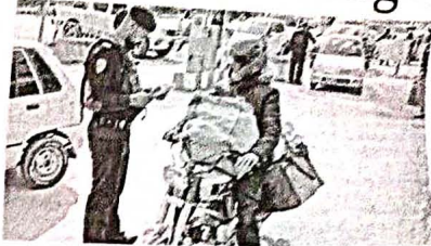
A policeman checks the documents of a delivery man at a checkpoint in Islamabad on Tuesday

They said a total of 93 have died while 216 others have been injured in the attack. "The death toll of Peshawar blast has risen as the rescue operation is still underway and debris of the mosque is being removed," the state-run Radio Pakistan reported.