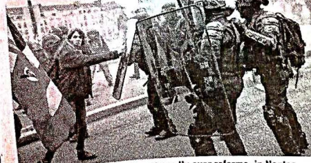
A protester faces riot police at a rally over reforms, in Nantes, France, on Tuesday