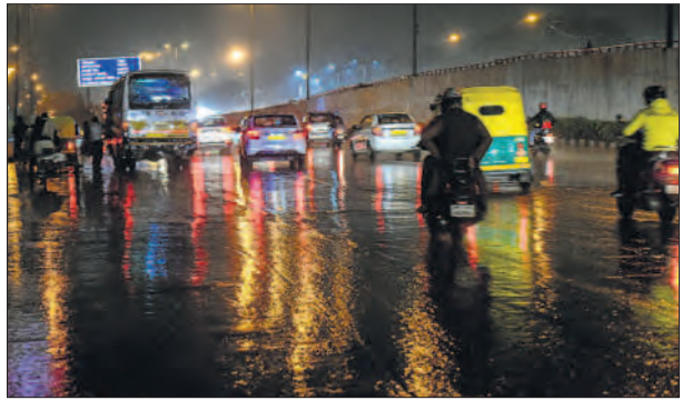
Parts of the national capital received light rain, followed by a thunderstorm and strong winds on Thursday.