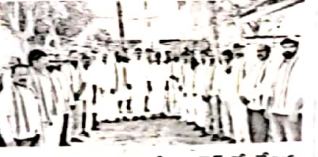
భద్రాద్రి కొత్తగూడెం లోని కేసీఆర్ కుటుంబీకులు... భద్రాద్రి కొత్తగూడెం లోని కేసీఆర్ కుటుంబీకులు... భద్రాద్రి కొత్తగూడెం లోని కేసీఆర్ కుటుంబీకులు...