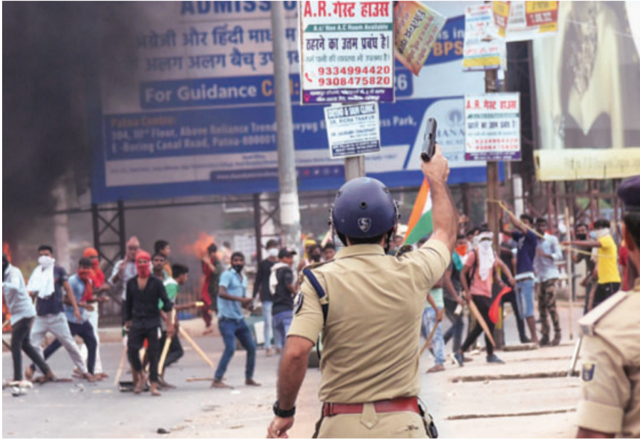
A cop aims to fire in the air to disperse people protesting against the Agnipath scheme in Bihar's Danapur on Friday. Internet services have been suspended in 12 districts of Bihar

In Telangana, protesters attacked trains at the Secunderabad railway station, leading to a firing in which a 19-year-old died.