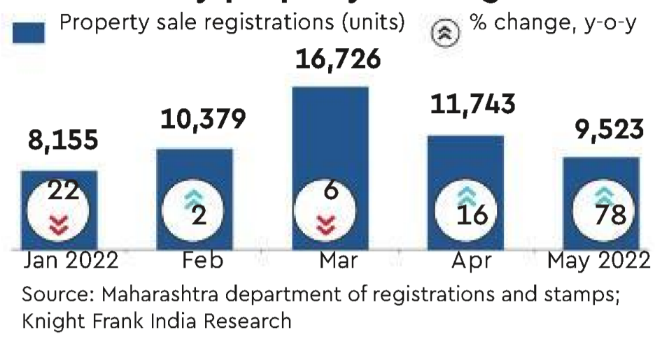
Source: Maharashtra department of registrations and stamps; Knight Frank India Research

price band of ₹1 crore and over, while in terms of apartment size, houses ranged between 500 and 1,000 sq ft.