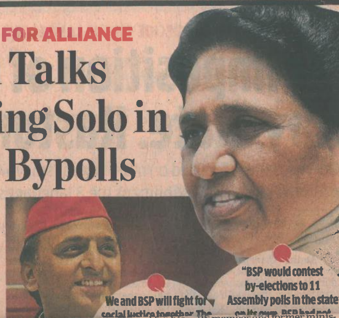
"BSP would contest by-elections to 11 Assembly polls in the state"

New Delhi: Former Uttar Pradesh chief minister and BSP president Mayawati has asked her party workers to start preparation for contesting the coming assembly by-elections in Uttar Pradesh. Although she did not