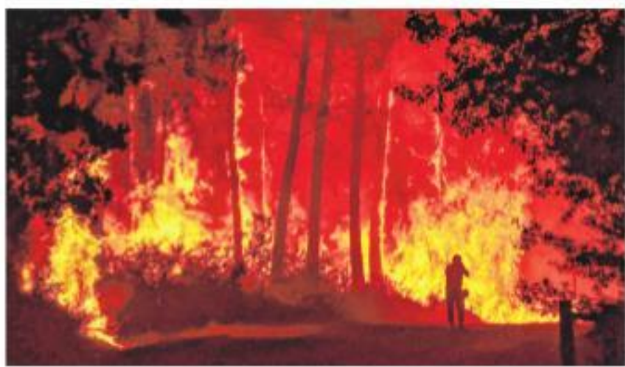
A silhouette is seen in front of flames at a wildfire near Belin-Beliet, southwestern France, on Thursday

Local authorities said more than 68 square km have burned since Tuesday in the Gironde region and neighbouring Landes as France,