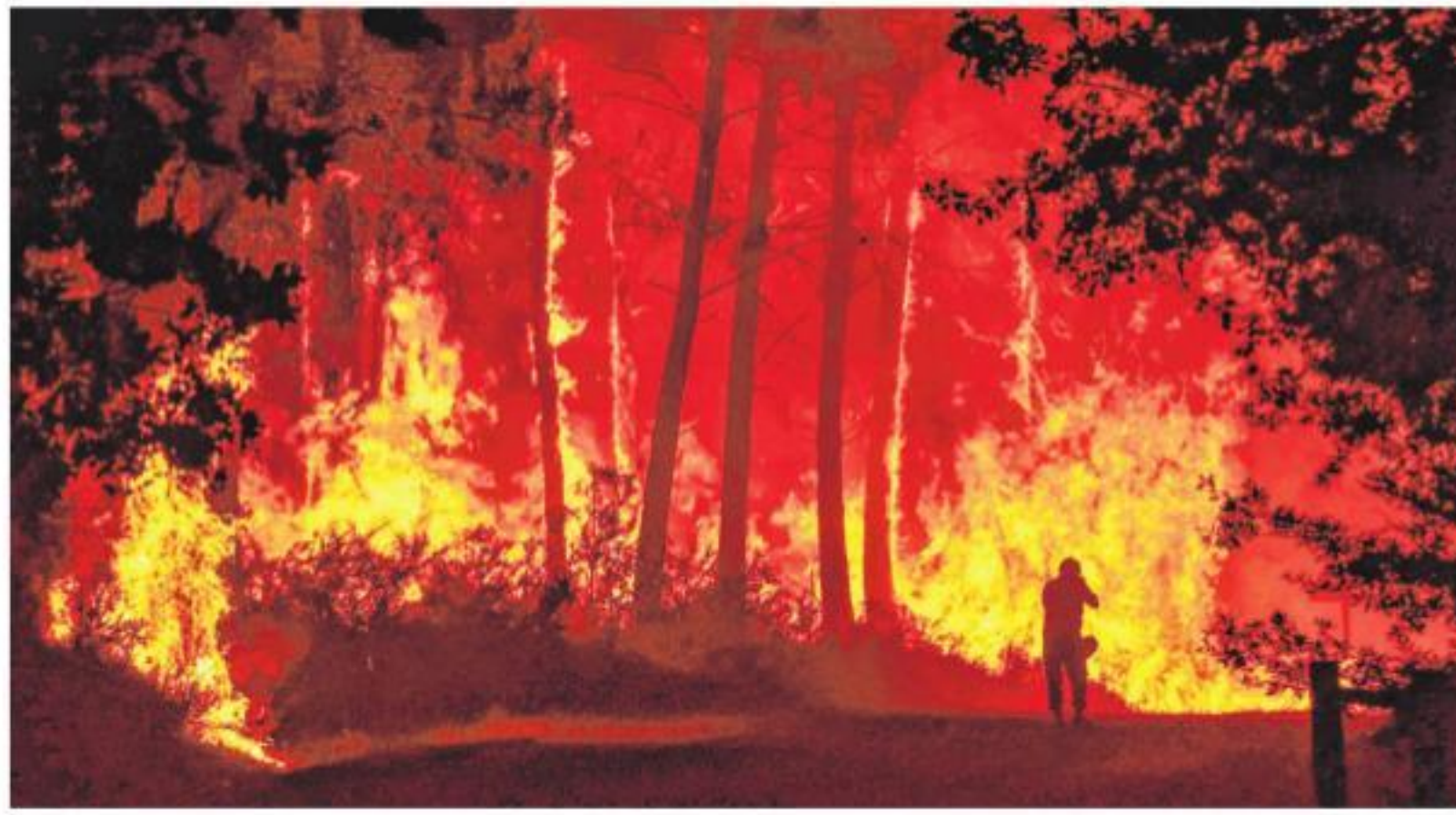
A silhouette is seen in front of flames at a wildfire near Belin-Beliet, southwestern France, on Thursday

Spanish state television showed dozens of trucks having to turn around and stay in Spain because of a border closure due to the fire raging in France. TVE reported that truckers, many