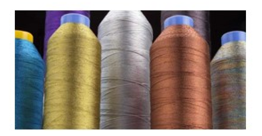
12<sup>th</sup> Annual Report