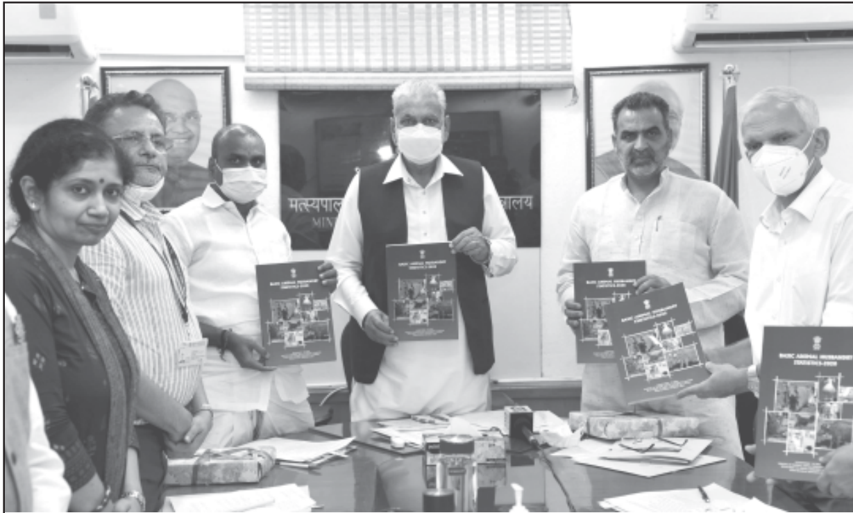
The Union Minister for Fisheries, Animal Husbandry and Dairying, Shri Parshottam Rupala at the virtual review meeting on the implementation of a special livestock sector packages and schemes with all the States & UTs Ministers, in New Delhi. The Minister of State for Fisheries, Animal Husbandry and Dairying, Shri Sanjeev Kumar Balyan and the Minister of State for Fisheries, Animal Husbandry & Dairying, Information and Broadcasting, Dr. L. Murugan are also seen.