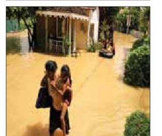
A woman wades through a flooded area in Kochchikade, Sri Lanka, Wednesday

COLOMBO: At least 16 people have died in floods and mudslides in Sri Lanka following more than a week of heavy rain, officials said Wednesday.