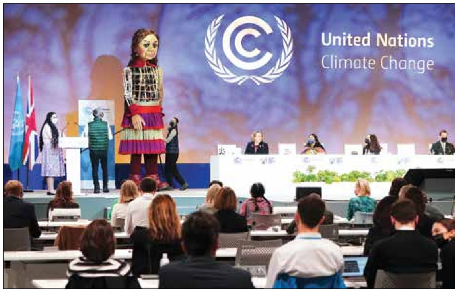
Giant puppet Little Amal stands on stage inside the venue of COP26 UN Climate Summit in Glasgow, Scotland

The draft also acknowledges with regret that rich nations have failed to live up to their pledge of providing 100