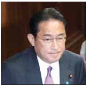
Fumio Kishida

Kishida re-elected Japan's PM in Parl vote