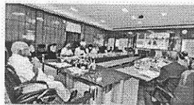
Chief Minister B S Yediyurappa at a video conference with DCS and 7P CEOs in Bengaluru on Thursday

It may be recalled that many ministers and leaders from the state had already visited Delhi and met the central leadership on the issue of cabinet expansion.