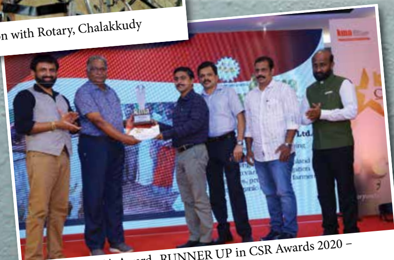
Receiving KMA Award -RUNNER UP in CSR Awards 2020 – Environment & Greenery Category.