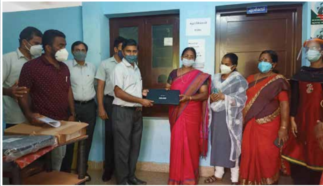
Donating Laptop to Public Health Centre , Kathikudam to support Covid vaccination for public