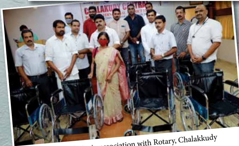
Donating wheel chairs in association with Rotary, Chalakkudy