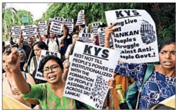
दिल्ली में श्रीलंका उच्चायोग के सामने लोगों ने प्रदर्शन किया।

नई दिल्ली : केंद्र सरकार ने मंगलवार को विपक्षी दलों को बताया गया कि श्रीलंका के मीडा संकट के दौर में भारत उसको हर मदद कर रहा है। मीटिंग में तब विवाद हो गया जब श्रीलंका की आर्थिक तबाही को बताने के दौरान वित्त मंत्रालय ने इस संकट से सवक लेने से संबंधित प्रेजेंटेशन दिया। इसमें केरल, तेलंगाना जैसे विपक्ष शासित राज्यों के कर्ज का मित्रक किया गया था। वित्त मंत्रालय में आर्थिक मामलों के सचिव की ओर से भारत के अलग-अलग राज्यों की वित्तीय स्थिति और उनके बढ़ते कर्ज के प्रतिकूल प्रभाव के बारे में बताया गया। इस पर विपक्षी सदस्यों ने आपत्ति दर्ज कराई कि वित्त मंत्रालय श्रीलंका के बारे में बताने के लिए है तो यह मुद्दा क्यों उठाया जा रहा है। विपक्षी दलों ने इसमें राजनीतिक का आरंभ लगाया और कहा कि अगर इस पर बात करनी है तो अलग से मीटिंग बुलाई और उसमें केंद्र सरकार के कर्ज की भी बात हो। इसके बाद यह प्रेजेंटेशन रोक दिया गया। विदेश मंत्री एस जयशंकर ने श्रीलंका के