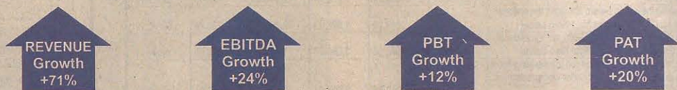
Figure above depicts consolidated result Q2, FY21-22 in comparison with Q2, FY20-21

Extract of Unaudited Financial Results for the Quarter & Half Year Ended September 30, 2021