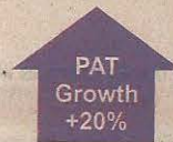
Figure above depicts consolidated result Q2, FY21-22 in comparison with Q2, FY20-21

Extract of Unaudited Consolidated and Standalone Financial Results for the Quarter & Half Year Ended 30th September, 2021