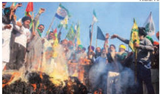
Farmers burn effigies during the 'Black Day' protest at the Punjab-Haryana-Shambhu border, in Patiala district, on Friday

The petition said the Centre and some states had given "threats" and invited Delhi's borders after several farmer unions called protests seeking a legal guarantee for MSP for their crops and implementing the Swaminathan committee's recommendations.